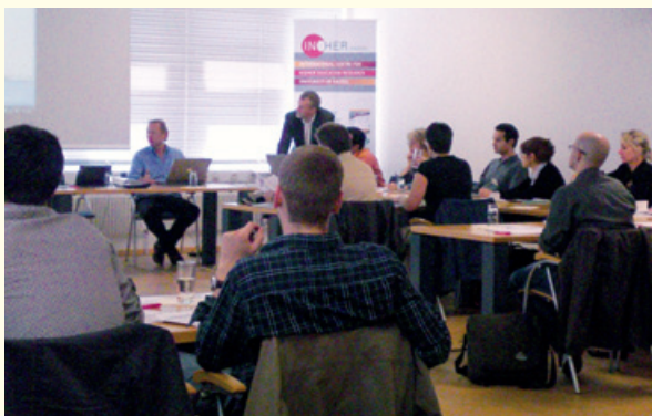
The first EuroHESC workshop, Kassel, 2010

The central aims of the workshop were (1) to help avoid duplication in the selection of case studies or subjects in the four CRPs, (2) to bring consistency and coherence to the methodologies employed, (3) to foster joint case studies and data sharing to the extent that was fruitful and possible (4) to benefit the junior project members in terms of research design and methodology, (5) to help integrate the junior project members properly into the greater EuroHESC programme. Junior researchers used this network event to share project work experiences, get to know each other's research focus more and benefit from intensive discussions with senior project members. After the workshop, EuroHESC PhD candidates and junior researchers took the opportunity to share and exchange ideas on their experiences and research themes, methodologies and approaches of their dissertations.