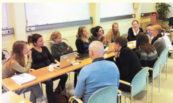
Breakout group in Helsinki, Workshop on Comparative Research, 2012

This workshop focused on the state of the art in international comparative studies in higher education research and on emerging topics and challenges on three different levels of analysis: comparisons of national higher education systems (system level), higher education institutions (institutional/organisational level), and behaviour, attitudes and working conditions of individual academics, students or graduates (individual level). The 25 participants and speakers represented three EuroHESC projects, CINHEKS, TRUE and EUROAC and two external commentators who offered a view of comparative research in other fields (Dr Juha Tuunainen and Dr Romy Wöhlert). The aim of the workshop was to discuss and reflect on the theoretical and conceptual potentials, pitfalls and opportunities (hypotheses about causalities, combination of quantitative and qualitative research or data comparability, etc.), as