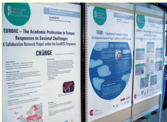
EuroHESC posters at ChER 2012

alternative approach to several overarching topics under consideration in EuroHESC CRPs: specifically, the transformation of HEIs and the societies in which they are embedded and the implications this has for governance and the production, transmission and transfer of knowledge. The workshop provided a critical overview of key approaches to the study of networks and an opportunity to contrast network-based approaches with other theoretical/methodological approaches, while considering their application to the EuroHESC CRPs and the empirical work still to be done. Sixteen members of the EuroHESC programme and one invited speaker, Professor Roger King, participated in the workshop.