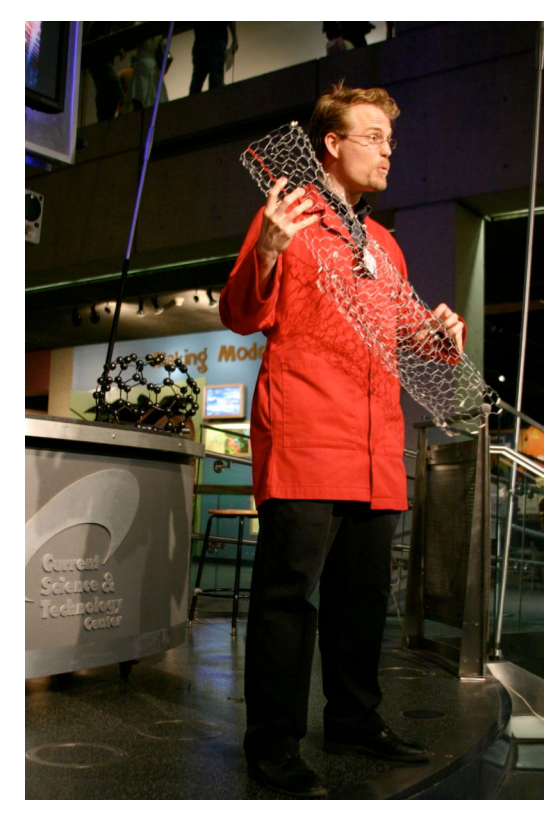
Live presentations by MOS staff