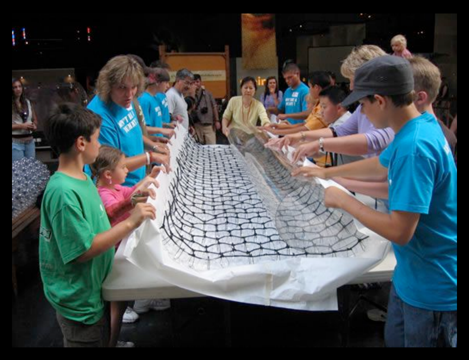
Creating a giant nanotube model