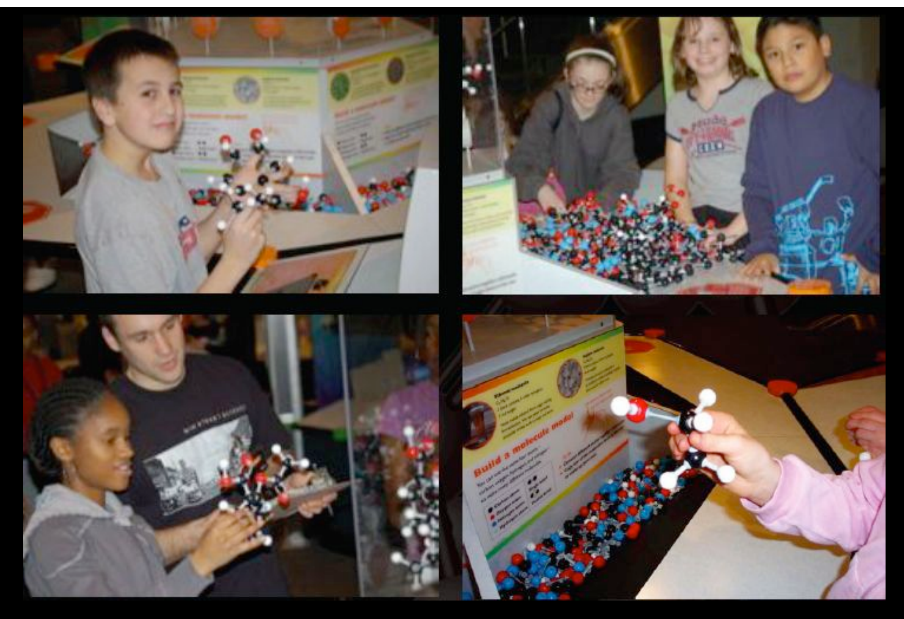
Research to learn how well various science thinking tools work with youth - molecular modeling