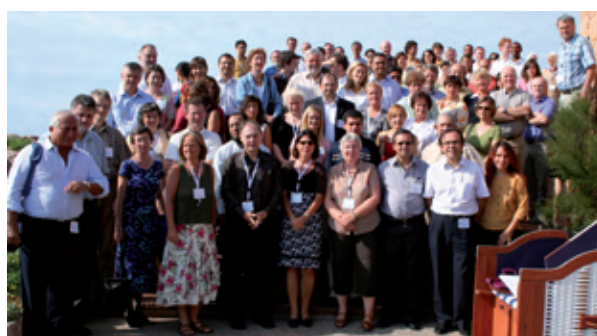
Participants at the first 2006 Nanomedicine conference