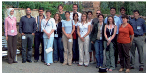
Young researchers at the 2006 Nanomedicine conference