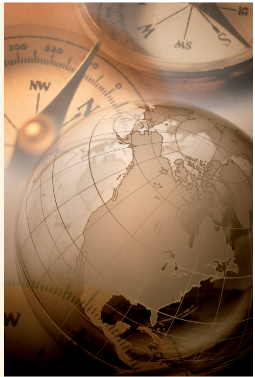
Figure 2. World Traveller

The new transnational community, imagined either out of a religion or an ethnicity that encapsulates linguistic and national differences, seeks self-affirmation across national borders and without geographic limits, as a de-territorialised nation in search of an inclusive (and