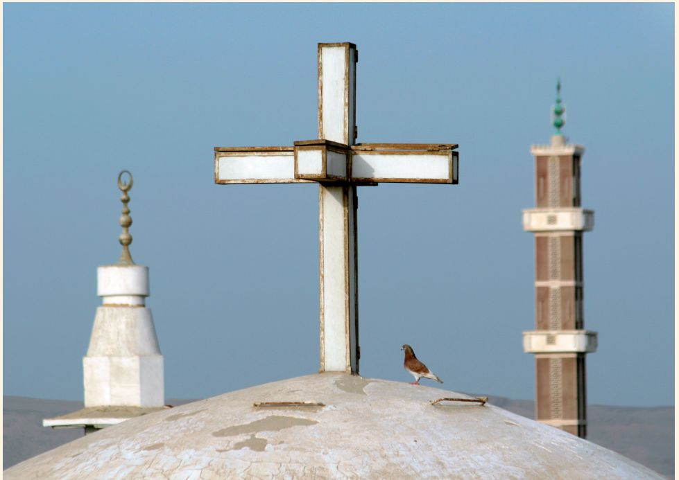
Figure 7. Cross & Crescent V

facing western democracies. How can we maintain and strengthen the bonds of community in ethnically diverse societies. How can we reconcile growing levels of multicultural diversity and the sense of a common identity which sustains the norms of mutual support and underpins a generous welfare state? Can we find a stable political equilibrium among immigration, multiculturalism policies and social redistribution?