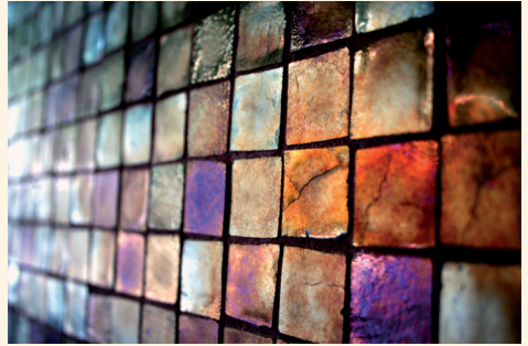
Figure 1. Tile

The project has singled out four issue areas which will be examined in depth in order to achieve a clearer sense of complex diversity , its implications for public policy, and policy suggestions/prescriptions: 1) linguistic diversity, 2) de-territorialised diversity, 3) religious