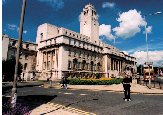
University of Leeds, United Kingdom

The methodological literature on qualitative research in the social sciences is globally, dominated by commercial publications from UK and US publishing houses, and English-language academic journals. The proliferation of such literature has promoted qualitative research but it has tended to overlook and marginalise the actual and potential contributions from other national and intellectual disciplines, especially from key European states outside the UK. There are important, but mutually isolated, traditions that relate to qualitative research that ought to be brought together. They can and should inform and