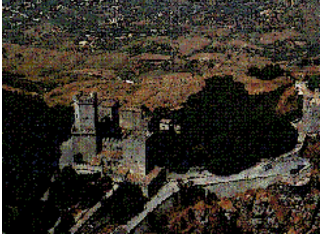
The Torre del Balio and Norman Castle