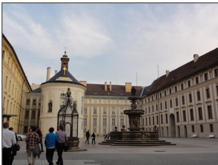
New Royal Palace