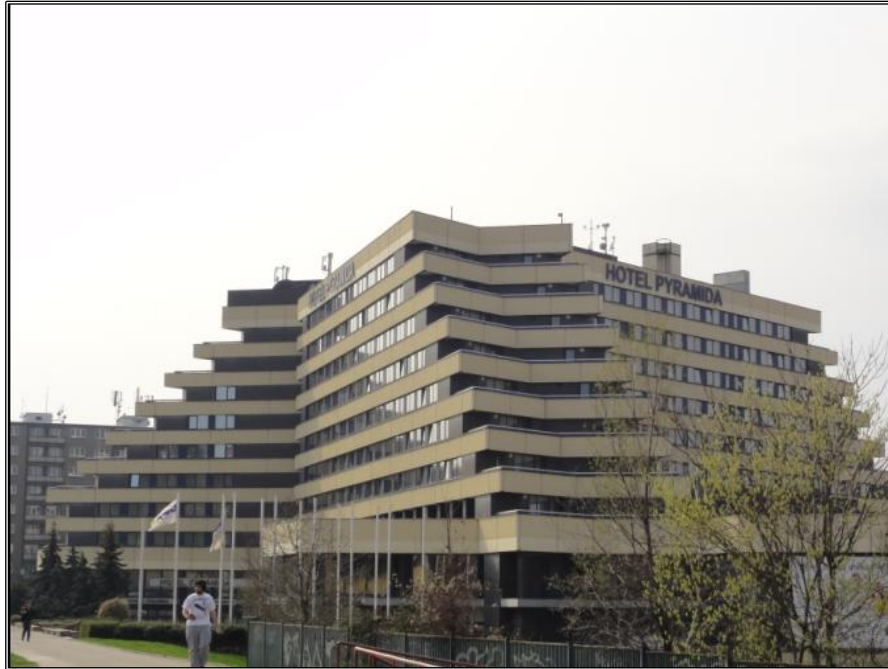
Hotel Pyramida in Prague

From 21 th to 24 th May 2013 10 th Carbohydrate Bioengineering Meeting held in Orea Hotel Pyramida in Prague, Czech Republic. The researchers from all around the world took a part in this conference. I could participate in this meeting thanks to the Travel Grant.