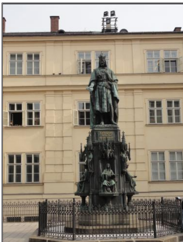
Charles IV Monument

During a conference many topics such as: synthesis, structure and function of carbohydrates and glycoconjugated, their usage in medicine were showed. For me very important was session 8 “Carbohydrates in health and medicine”. All the presentations were well prepared and many interesting aspects were discussed. This area is very interesting for me, because in our laboratory, we are working on using carbohydrates derivatives to prevent cancer. This session motivated me and gave me many interesting ideas for further research.