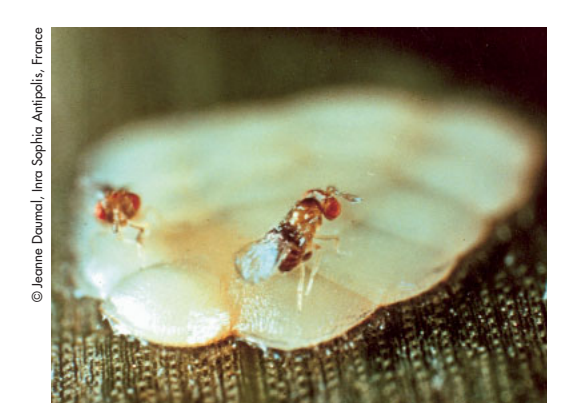
Trichogramma brassicae females attacking eggs of Ostrinia nubilalis.

Though the BEPAR programme is primarily orientated within the behavioural ecology paradigm, a major goal is to make links between behavioural ecology and other aspects of evolutionary ecology. This is being done in several ways in the BEPAR programme. In studying the co-evolution of host resistance and parasitoid virulence, actual genes involved in these traits should soon be identified, and their dynamics in the field will be studied. This will enable us to test some old but little explored theories about host-parasite co-evolution. Recent studies have quantified genetic variation in a number of traits involved in foraging and sex ratio, allowing phenotypic behavioural ecology models to be compared with those from a quantitative genetic background. Finally, parasitoids were the subjects in some of the first comparative studies in behavioural ecology using different related species. More comparative work will be developed within the BEPAR programme, thanks to newly available improved (molecular) phylogenies.