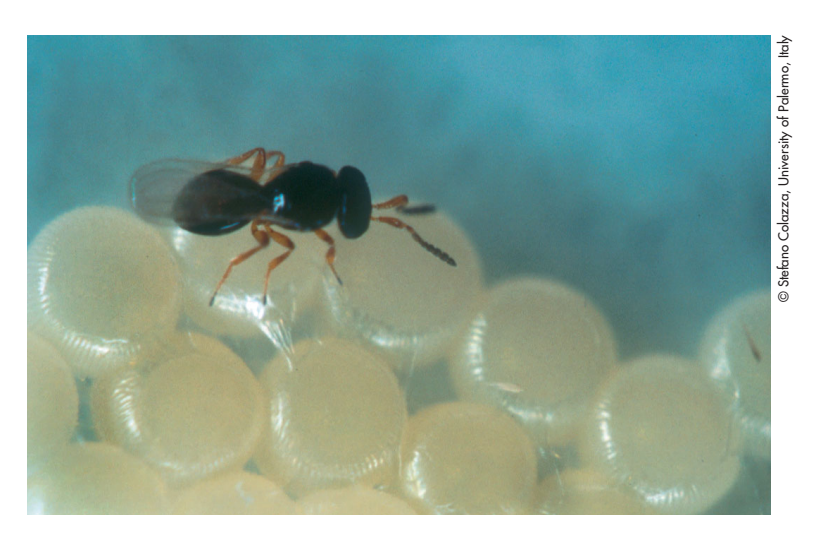
A Telenomus busseolae female attacking eggs of one of its host Sesamia nonagrioides.