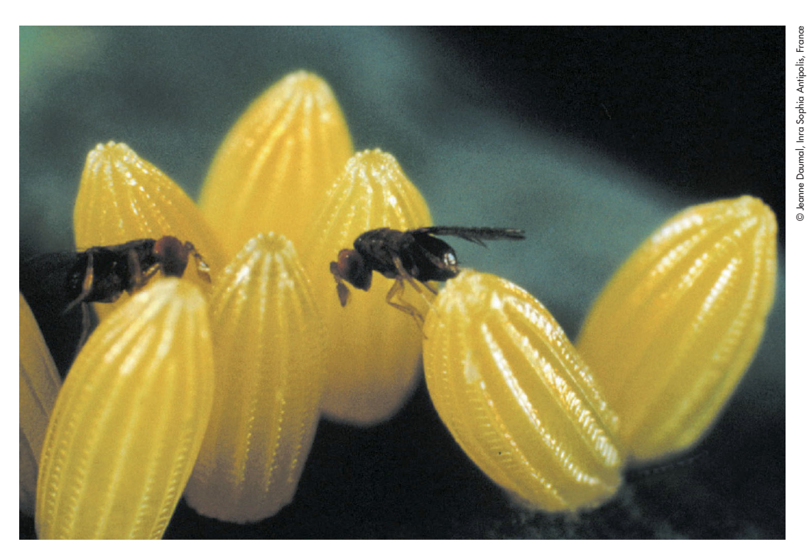
Trichogramma females attacking eggs of Pieris brassicae.

mathematical techniques. A more complex situation arises when the outcome of the behaviour of an individual depends on the behaviour of conspecifics. A classical example is a group of parasitoids exploiting a number of host patches together. As the departure of an individual from a patch would increase host availability to remaining animals, the foraging success of each animal would depend on the patch residence time adopted by others. In this case, the question asked is not whether a given behaviour is "optimal" but whether it is "evolutionarily stable" (i.e behaviour that, when adopted by the whole population, cannot be replaced by any mutant). Game theory, a mathematical technique used mainly in economics, has been adopted to solve this kind of problem with extraordinary success.