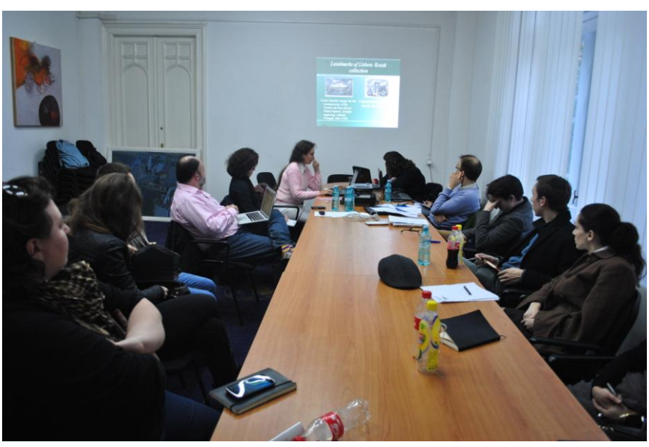
Public presentations round table (see attached programme for details)